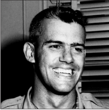
Humbert "Rocky" Versace, circa 1963.

captivity, among them James Stockdale and George "Bud" Day for their leadership among fellow prisoners. Stockdale's and Day's stories are well-known, having led accomplished careers after their release from years of North Vietnamese imprisonment. Among those lesser-known recipients is Humbert "Rocky" Versace, who tragically did not return from the jungles of South Vietnam. The son of a career Army officer, Versace graduated from West Point in 1959 and qualified as an Army Ranger later the same year. After a tour of duty in South Korea, Versace volunteered for assignment in Vietnam in 1962 during the advisory period of the conflict. After visiting an Academy classmate at a remote jungle encampment, Versace and South Vietnamese guerillas were attacked by a large force of Viet Cong