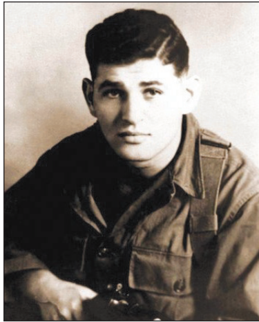
Tibor Rubin, circa 1950.

Born to a Jewish family in Hungary, Tibor Rubin had been imprisoned before he ever set foot on the battlefield. Sent with his family to Mauthausen concentration camp, Rubin lost his mother, father, and sister in the Holocaust, and moved to America for a better life in 1948. Then the Korean War broke